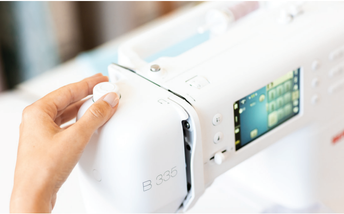
Individually adjustable presser foot pressure