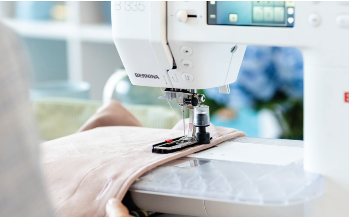
Perfect buttonholes with the Buttonhole Foot with Slide #3A