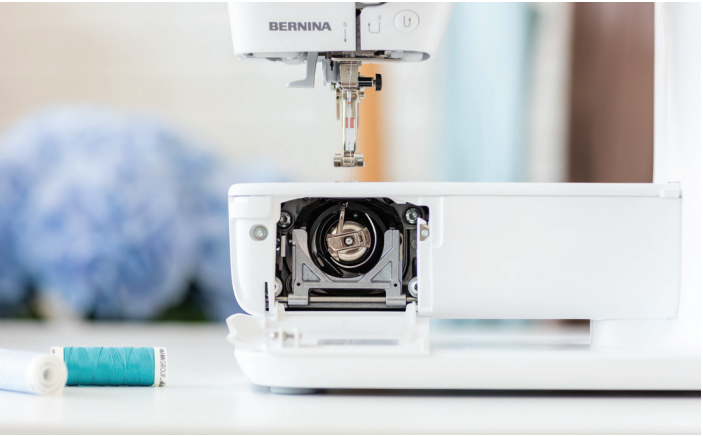
Handling from the front when changing the bobbin