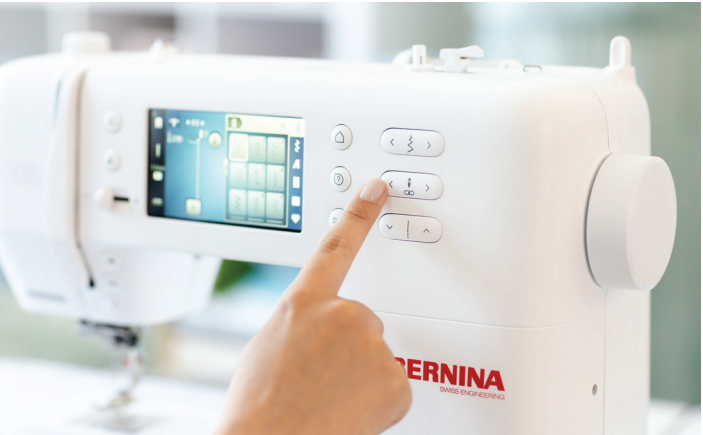
Simple handling via touch screen and direct selection buttons